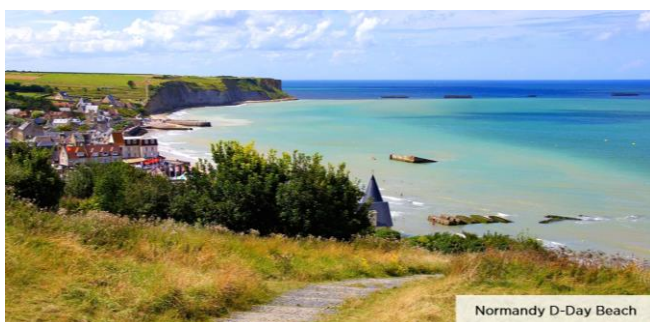
Normandy D-Day Beach