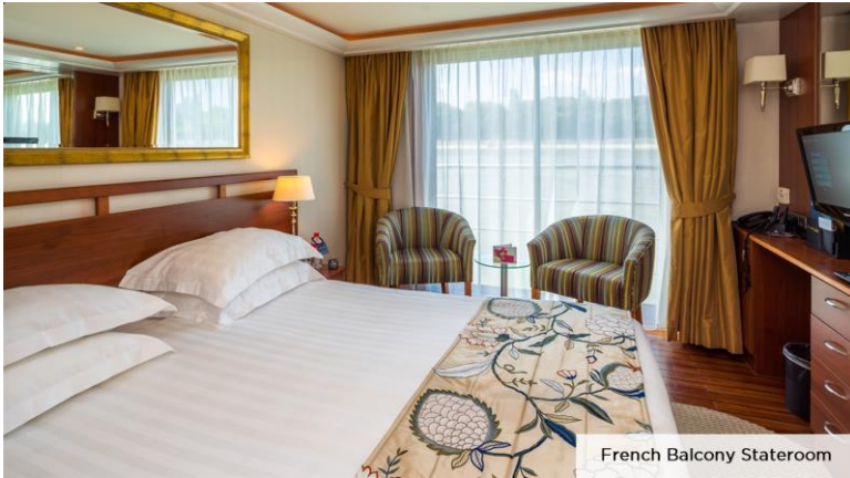
French Balcony Stateroom

7-night cruise | June 12-21, 2025 | Aboard AmaDante